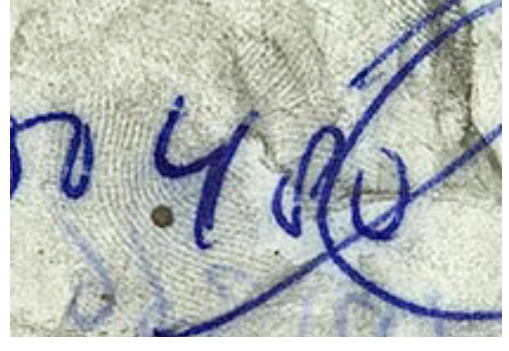
Partial fingermarks developed with PD on notepad paper.