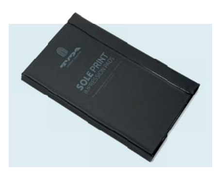
FOLDER CONTAINING TWO ENCAPSULATED FOAM IMPRESSION PADS.