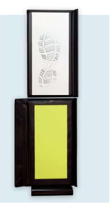
WITH THE IMPRESSION PADS SEPARATELY PLACED NEXT TO EACH OTHER IT IS EASIER TO MAKE A PRINT WHILE WALKING OVER THE COATER AND PAPER. THIS IS ALSO A MORE ERGONOMIC WAY OF MANUALLY MAKING THE PRINTS.